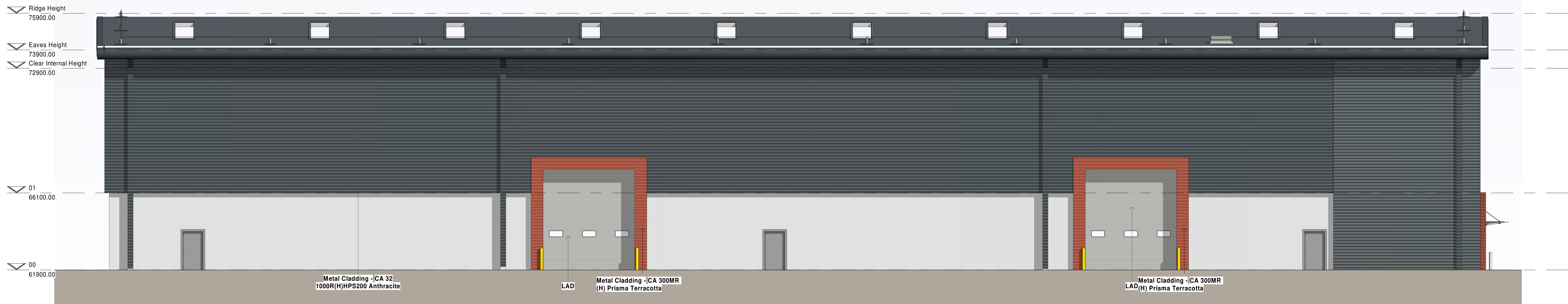
2 Planning Elevation South 1 : 100