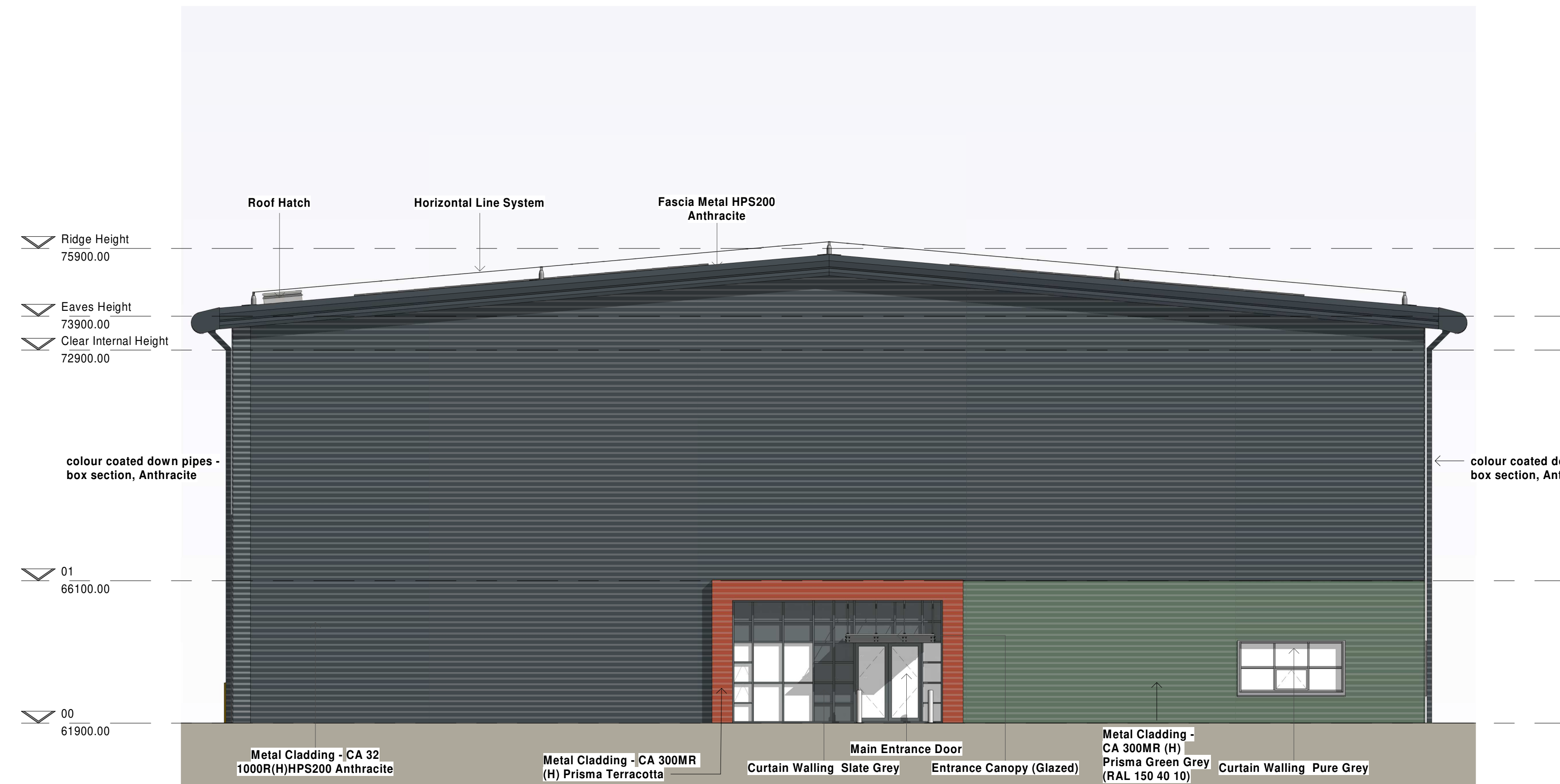
3 Planning Elevation East 1 : 100